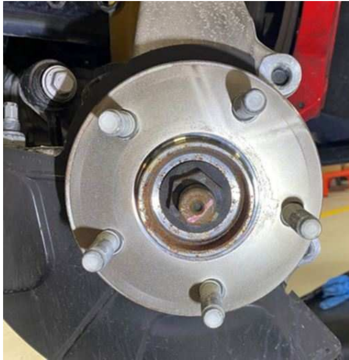
Fig. 3 Friction Disc Installed On Hub