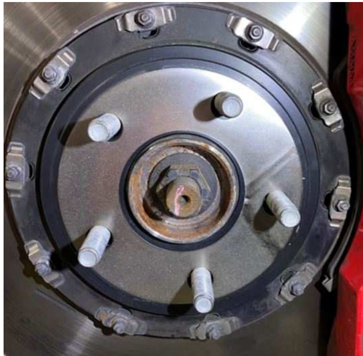
Fig. 4 Friction Disc Installed On The Rotor