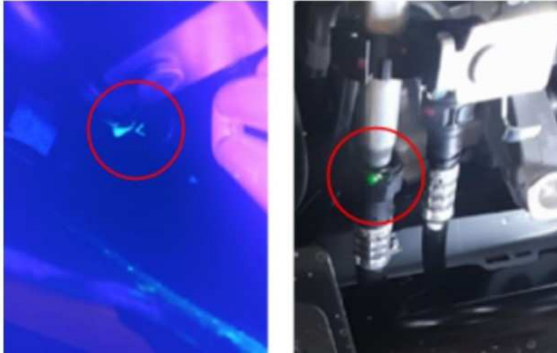
Fig. 1 Areas To Check For Leaks