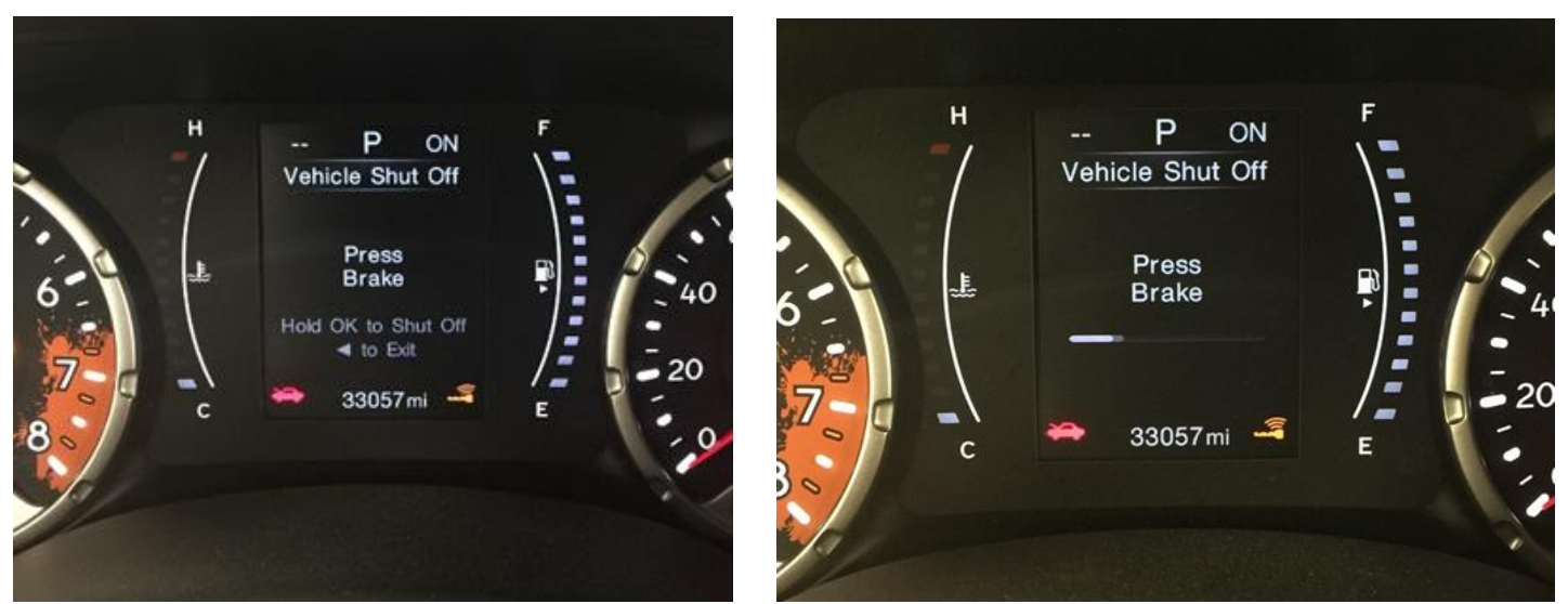
Step 5. First, press and hold the brake pedal AND THEN press and hold the OK button. The Press Brake timer will start.