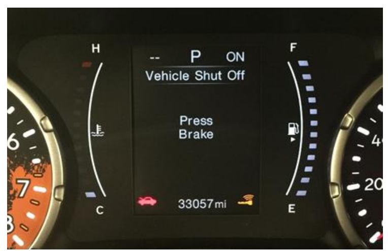
Step 4: Once the timer has completed and the "Press Brake" message is displayed. You must release the OK button.

This document does not authorize warranty repairs. This communication documents a record of past experiences. STAR Online does not provide any conclusions about what is wrong with the vehicle. Rather, it captures all previous cases known that appear to be similar or related to the vehicle symptom / condition. You are the expert, and you are responsible for deciding on the appropriate course of action.