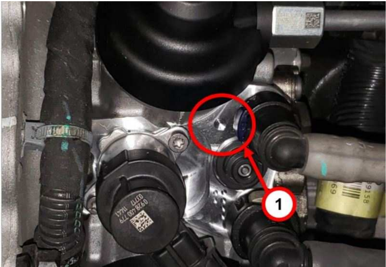
Fig. 1 New Style Symmetrical Cam Design Pump