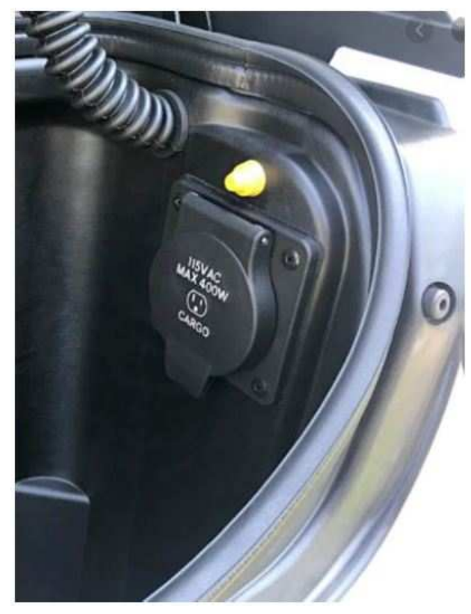
Fig. 4 RAM Cargo Box AC power outlet