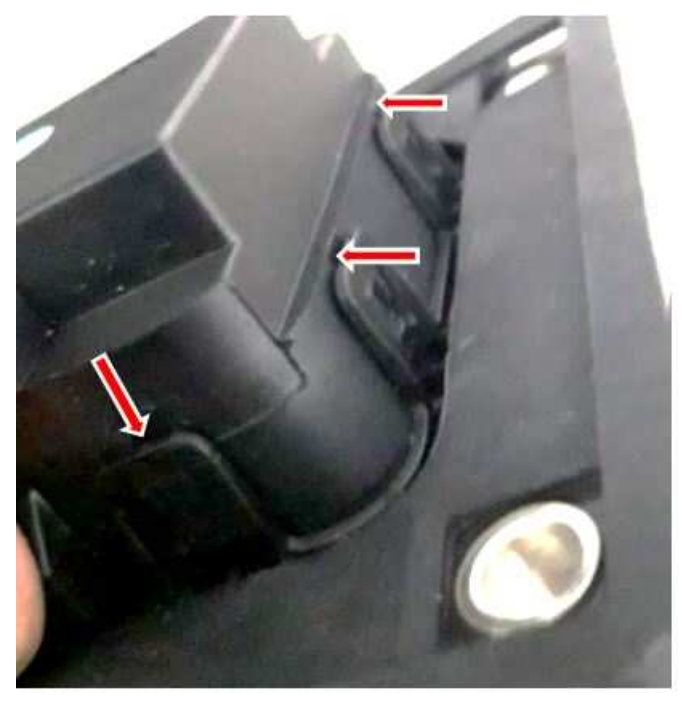
Fig. 7 Location for Loctite 401

5. Apply Loctite 401 to all eight of the retaining tabs (Fig. 7).