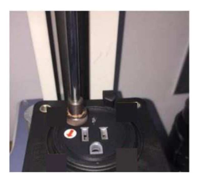
Fig. 3 Extension on AC power outlet

1 - Pull Gauge (8828B) 2 - 1\4 inch extension, 14 inches long