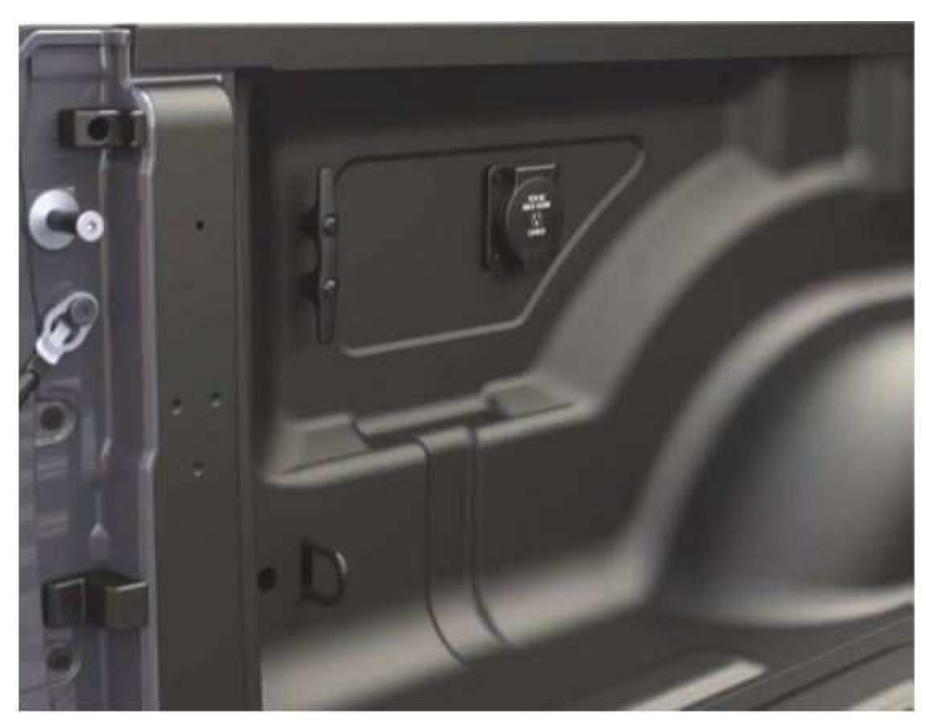
Fig. 5 RAM Bed Mounted AC power outlet