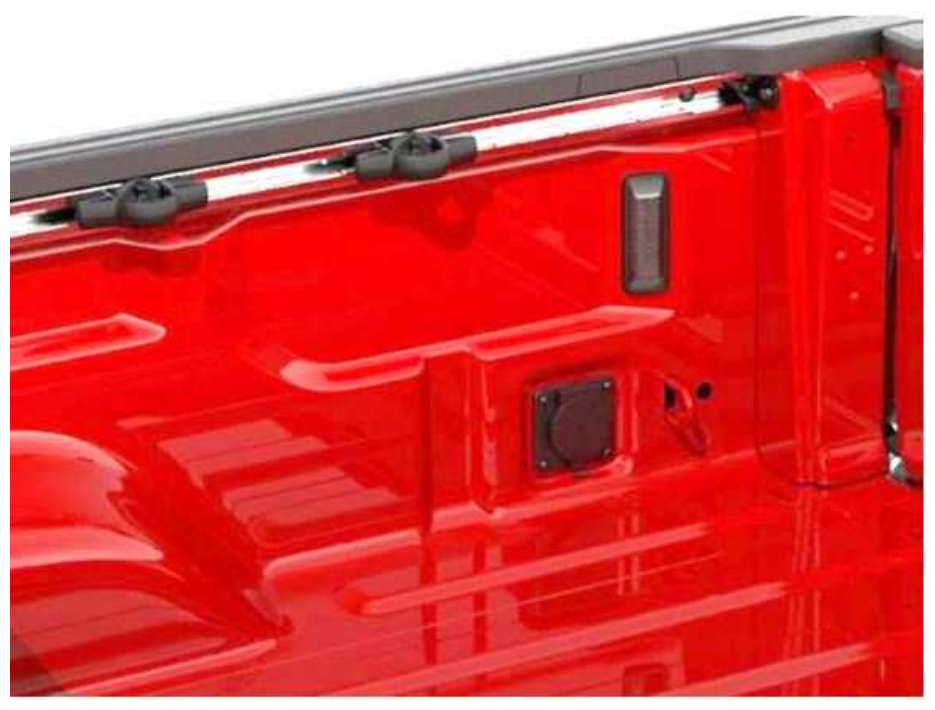
Fig. 6 Gladiator Bed Mounted AC power outlet