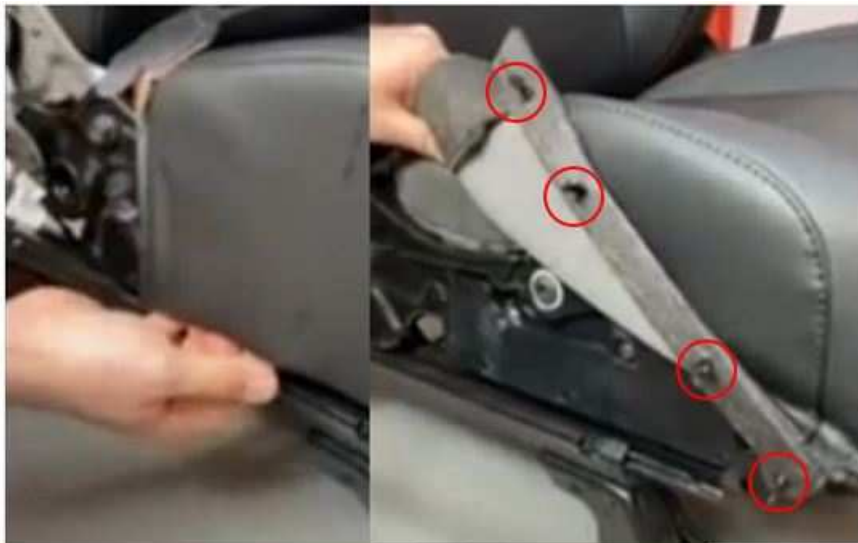
Fig. 3 Side Seat Cover and Push Pin Retainers