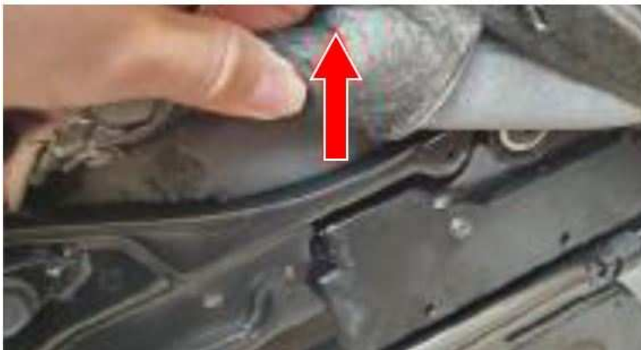
Fig. 4 Reposition Seat Bolster