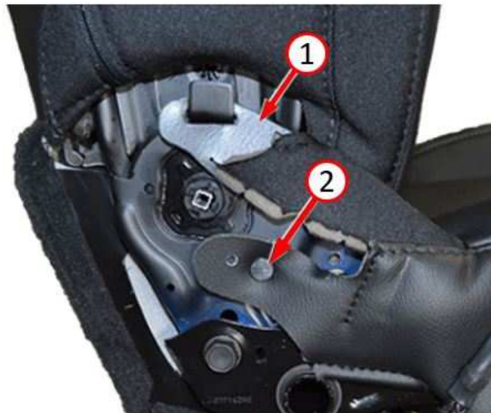
Fig. 2 Seat Cover Retainers