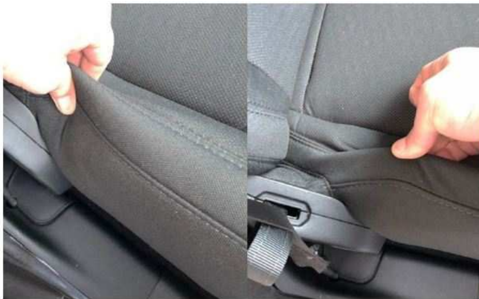
Fig. 1 Empty Seat Bolster