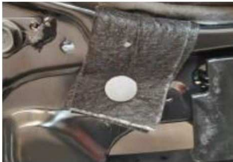
Fig. 8 Strap and Push Pin Attached to the Frame