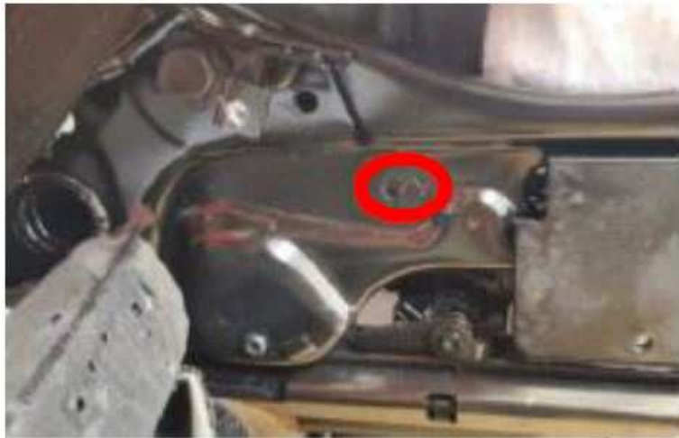
Fig. 7 Hole Location for Push Pin