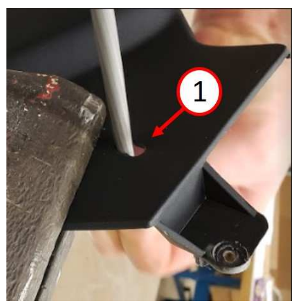
Fig. 1 Back Side Shield Hole Being Elongated