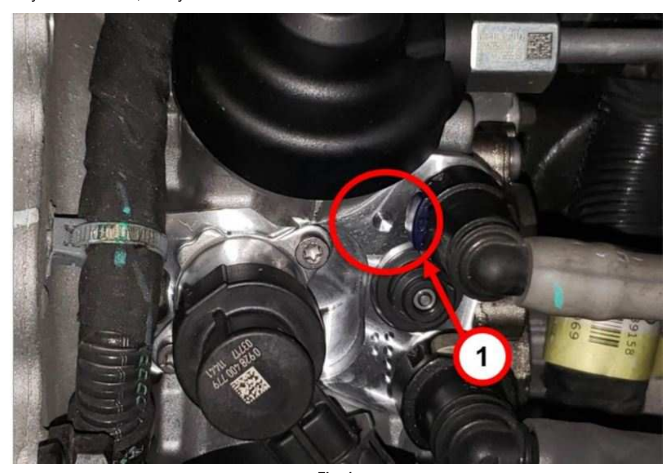
Fig. 1 New Style Symmetrical Cam Design Pump