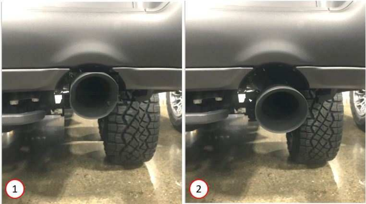
Fig. 1 Exhaust Tip Examples