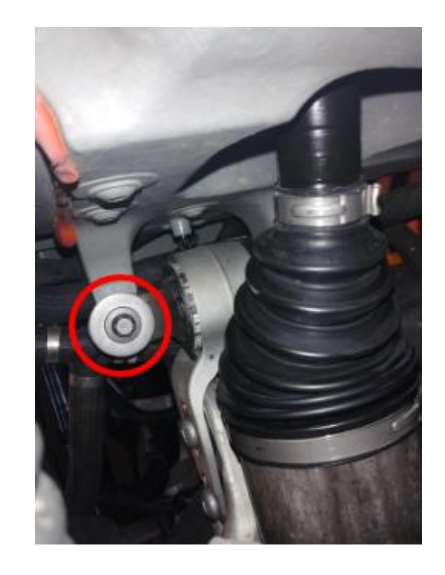
Figure 2 Figure 3