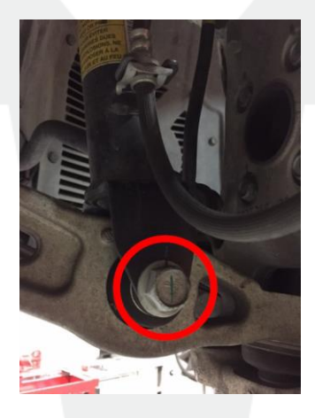
Figure 4 - LH shown; RH similar