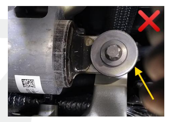
Figure 5 Figure 6

b. Loosen, but do not remove, the bolts that attach the front drive unit clevis to the body (Figure 7).