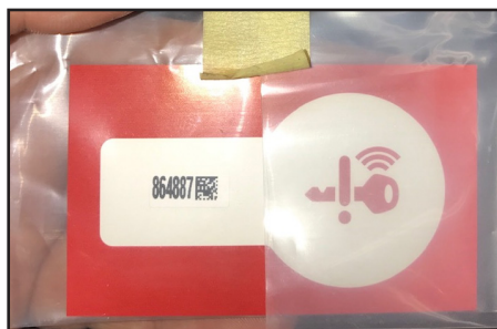
Actual Smart Key emergency code

Below is an image of the actual smart key emergency code card supplied with the vehicle. Yamaha does NOT keep a record of this information. It is your responsibility as a dealer to record this information and provide it to the customer at the time of sale.