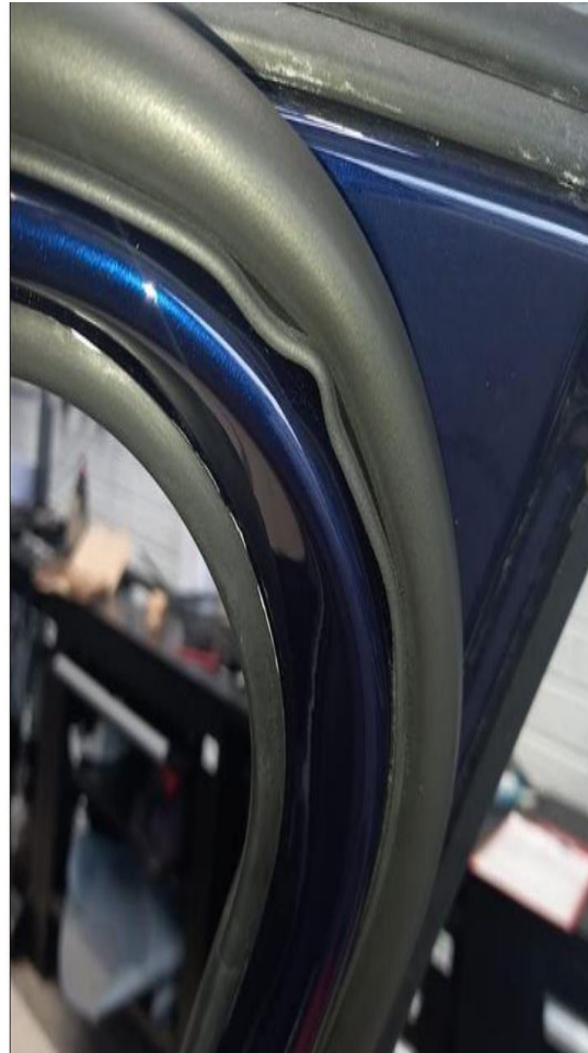
Figure 1. The outer door seal detached from the door.

The adhesive bond for the outer door seal can come loose in the entire area where the outer door seal makes contact with the door (Figures 1 - 4).