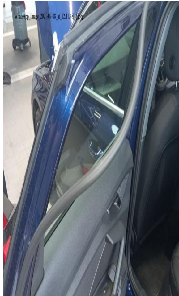
Figure 3. The outer door seal detached from the door.