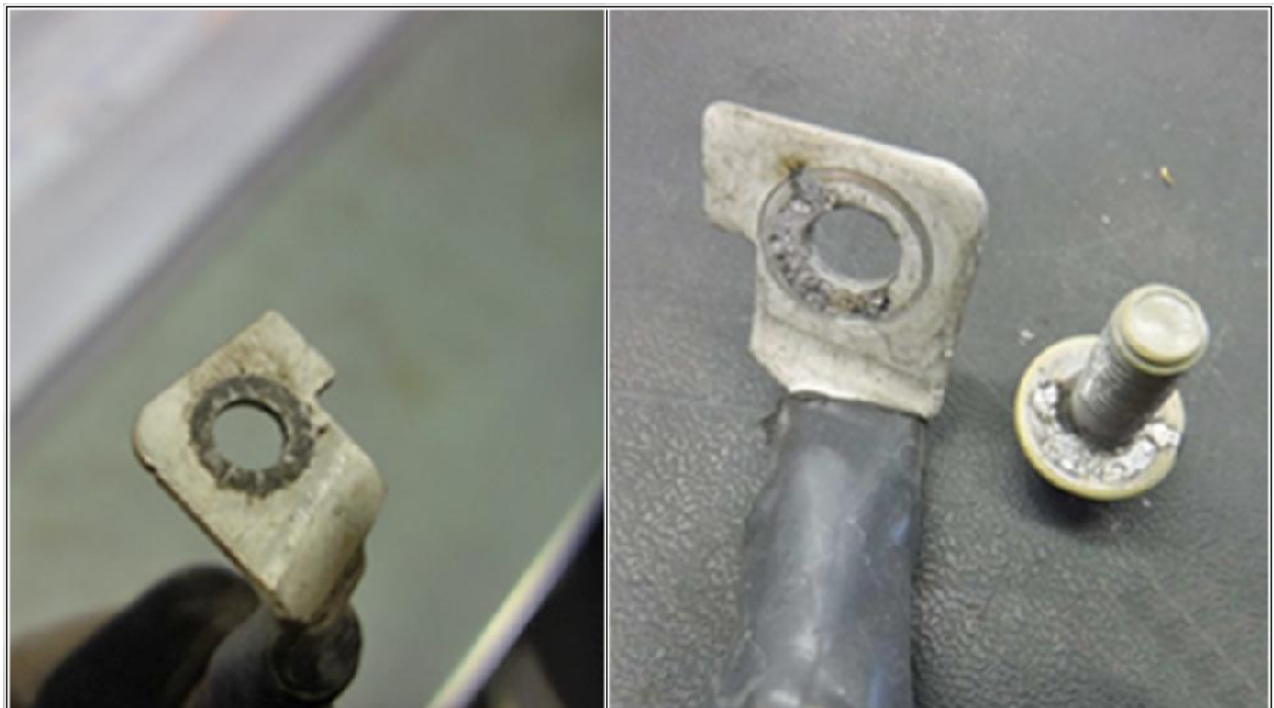
Fault type – ground strap and ground screws