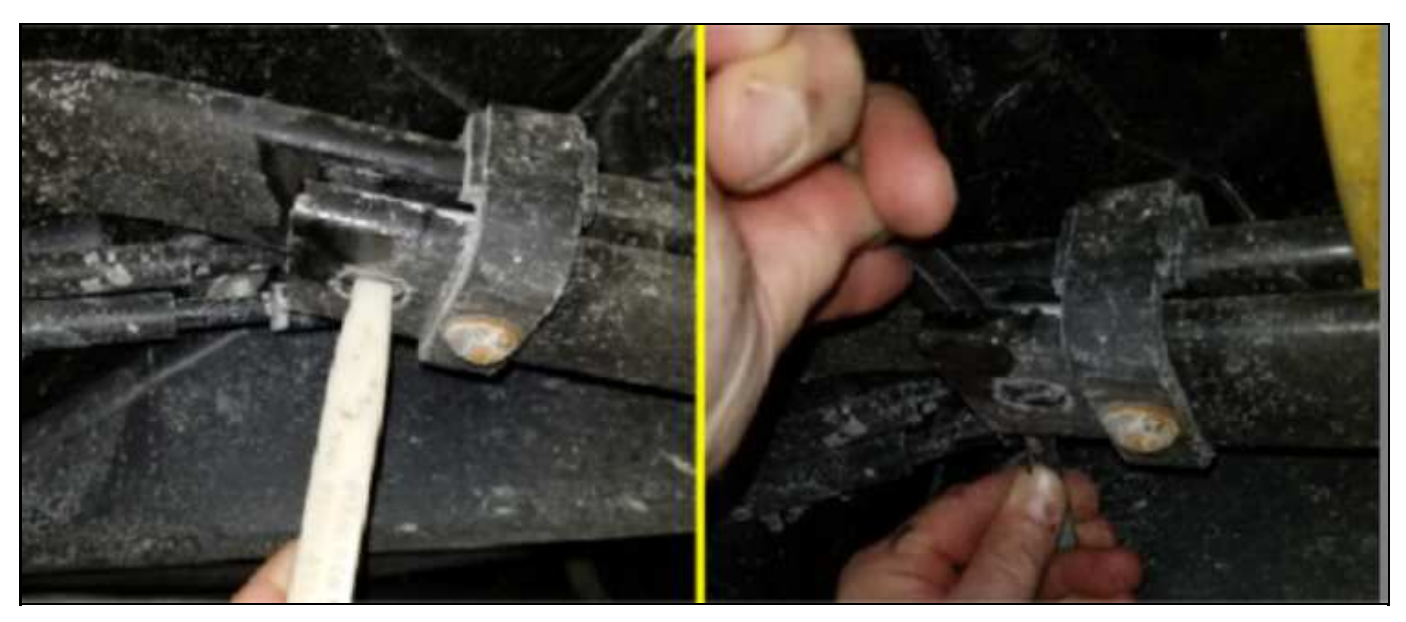
3.2. Push up on insert until it hits the bottom of the spring above it. Then use a suitable cutting tool to cut the stem off from the insert.

Caution: Do NOT damage the finish on Leaf Springs. 3.1. On the spring assembly, insert a plastic trim tool or plastic wedge in between the #1 and #2 leaf springs, to access the old insert.