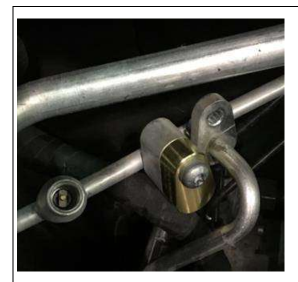
Figure 4a. Installation of high side rear A/C Line connection block adaptor VAS 6338/63.

7. Remove expansion valve and install flush plate VAS 6338/38. (Figure 3)