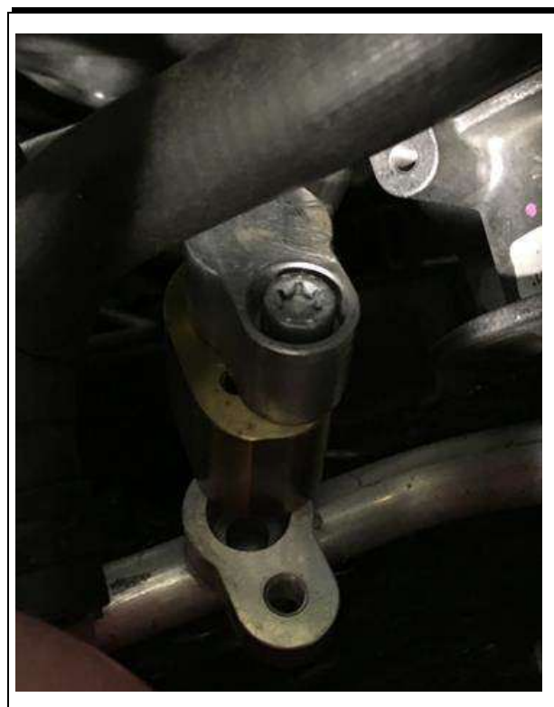
Figure 14. Location and connection of the adaptors for the rear unit A/C lines