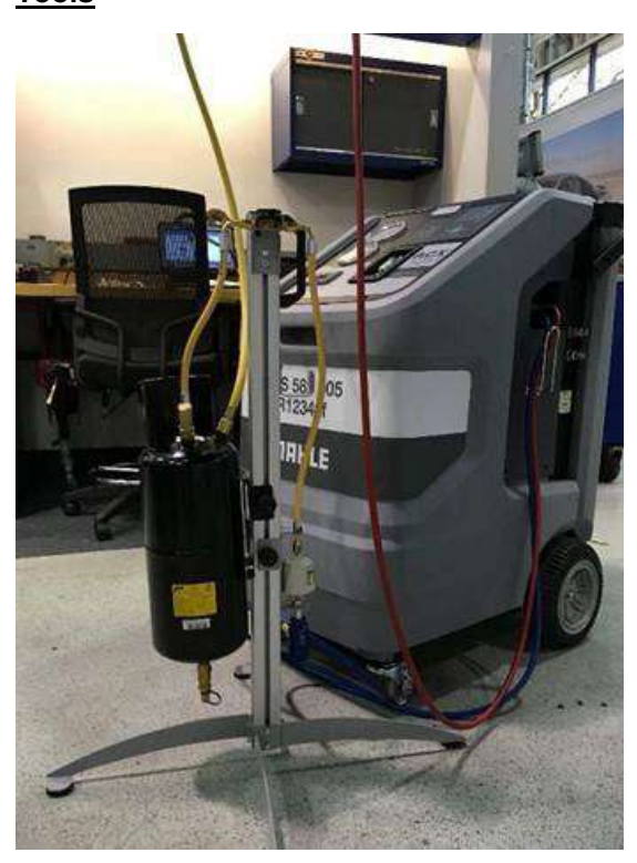
Figure 1. The VAS581005 Air Conditioning Service System with Flushing Device.

Use an approved R1234yf servicing machine and the R1234yf Flush Kit RTI360831840 (Figure 1).