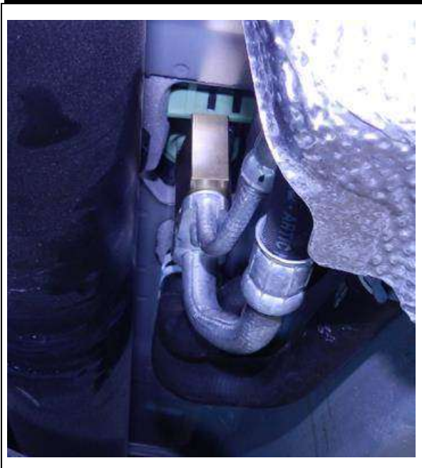
Figure 13. Location of rear air conditioning unit expansion valve.

23. Remove rear expansion valve and install VAS6338/38 as shown. (Figure 13)