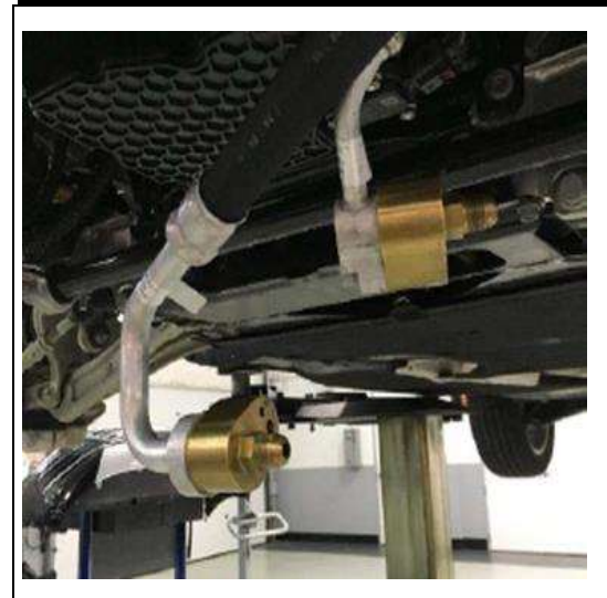
Figure 6. Installation of VAS 6338/3 and 6338/12.

10. Disconnect A/C compressor hoses from the compressor.