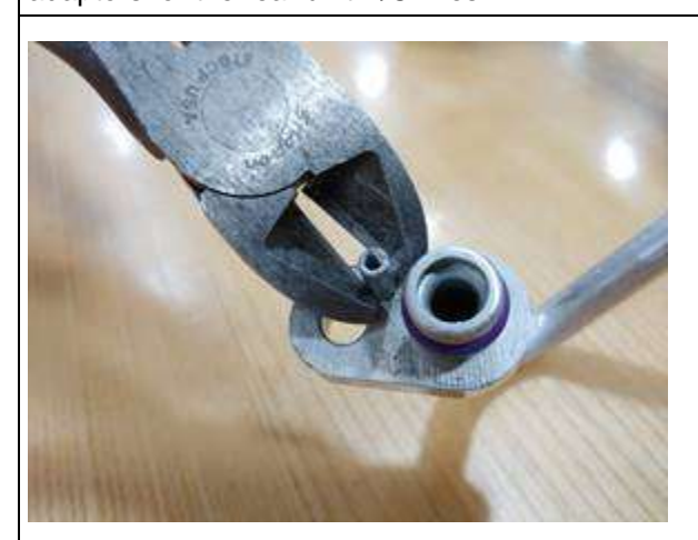
Figure 15. Removal of dowel pin.