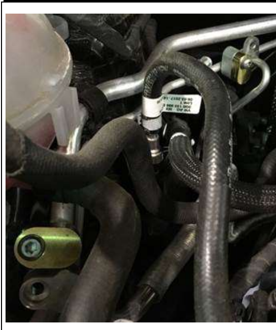
Figure 4b. Installation of Low side rear A/C Line connection block adaptor VAS 6338/5.