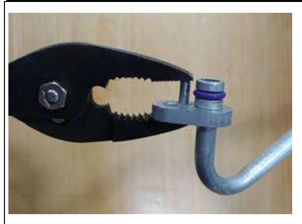
Figure 16. Installation of rear refrigerant line dowel pin.