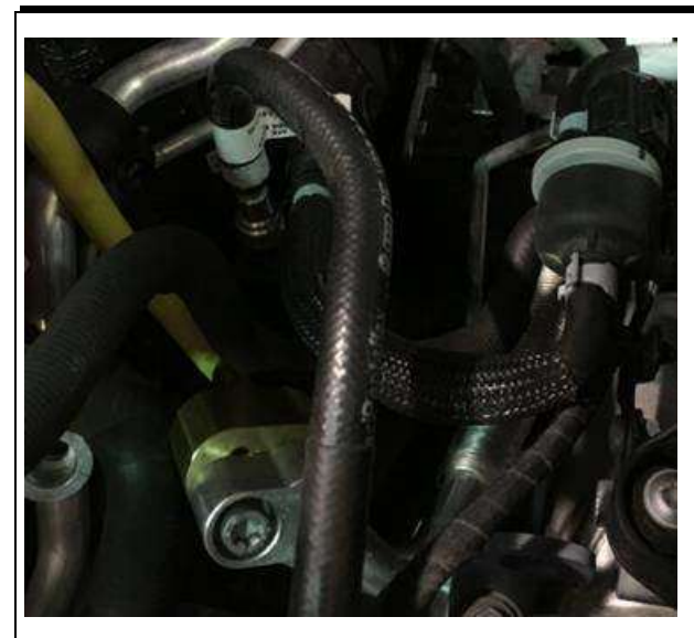
Figure 17. Attaching service station and flush hoses to rear A/C lines.

27. Perform an extended 3 cycle flush on the rear A/C unit.