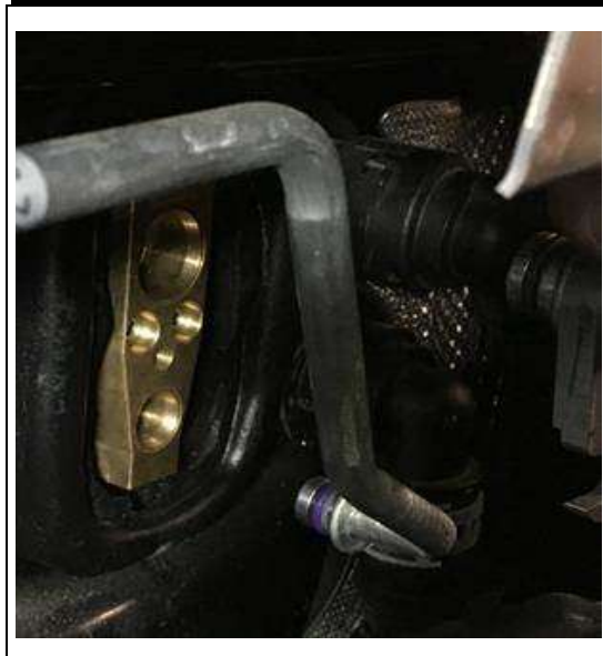
Figure 3. Installation of front expansion valve bypass adaptor VAS 6338/38.

7. Remove expansion valve and install flush plate VAS 6338/38. (Figure 3)