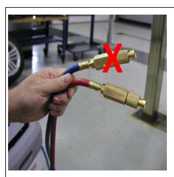
Figure 5. A.C hose adaptor 6338/44.

9. Remove A/C Recovery machine high side coupler from hose.