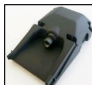
Front View Camera

Printed TSB copy is for reference only; information may be updated at any time. Always refer to KGIS for the latest information.