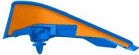
Figure 2. Improved seal at the end of the spoiler body.