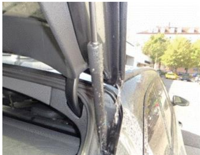
Figure 1. Water rushing from a poorly sealed rear spoiler connection.