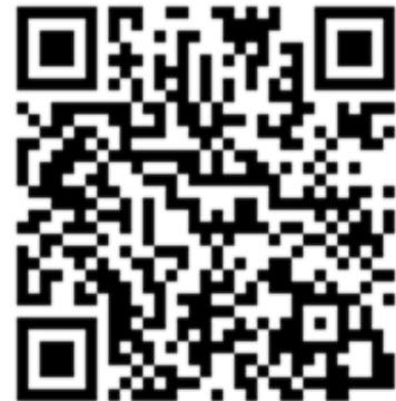
Figure 2. QR code for viewing the supporting video with a QR code reader on phones and tablets. Alternatively, the video can be accessed through computer internet browsers at the link provided in this bulletin.