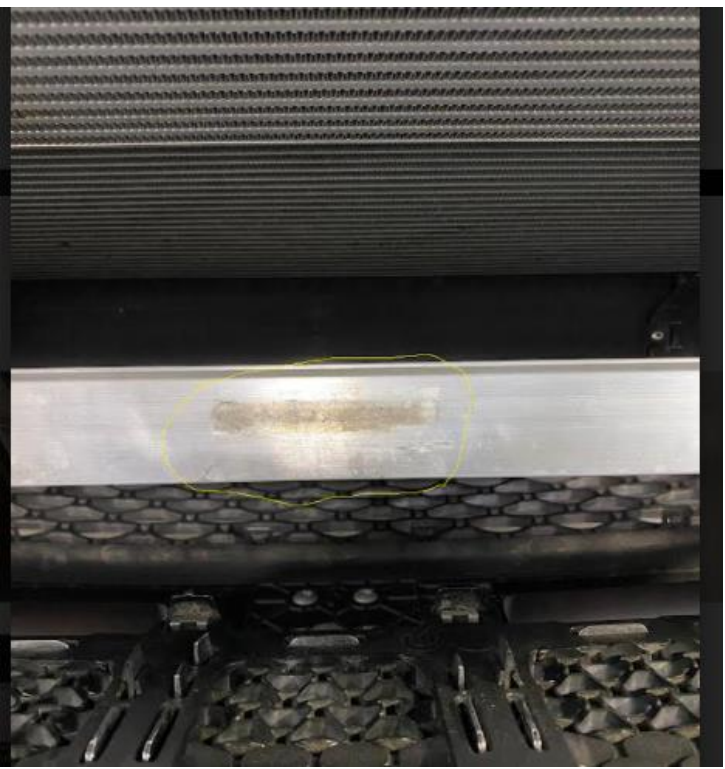
ACC witness mark on Aluminum bumper

Repair: The aluminum bar may be adjusted too high allowing contact with the ACC module. To resolve, begin by removing the front fascia from the vehicle. Then loosen the aluminum bumper mounting bolts and slide the bumper DOWN as far as possible. There are small studs designed to locate the bumper during assembly that will limit downward adjustment. Review image below.