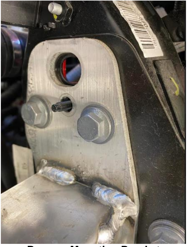
Bumper Mounting Bracket

Once the bumper bar has been moved down as far as it can go, retighten the bottom mounting bolts first, then the top. Reinstall the ACC module and confirm it is no longer making contact with the aluminum bumper bar.