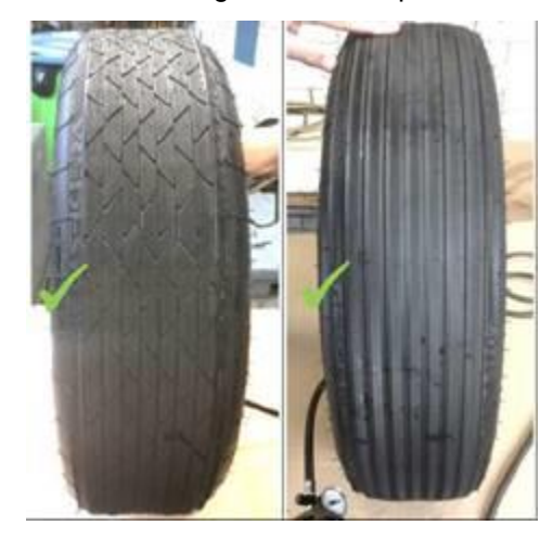
Figure 1. Correct tire position – tread aligned symmetrically with the rim/hub.

The collapsible spare wheel is in suitable condition to use on the vehicle when the tire tread is aligned horizontally with the hub. When this is the case, the side wall of the collapsible spare wheel may not be aligned symmetrically with the rim, giving the impression that the tire has not inflated fully. The compressor reaches a pressure of 3.5 bar after running for a certain period; this is sufficient for using the tire (Figures 1 -2).