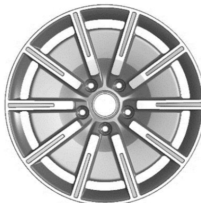
Taycan Sport Aero wheel