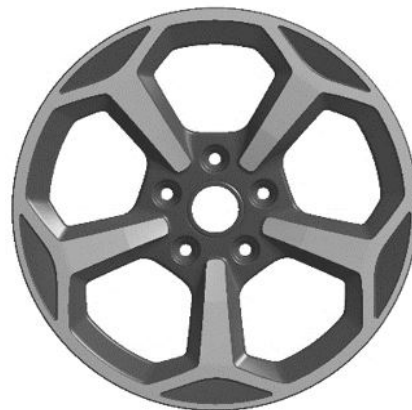
Taycan off-road wheel

RA: 11J x 20, RO 60 Part No. 9J1.601.025.AT_FFF