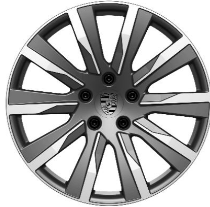
Taycan TEQ Design wheel