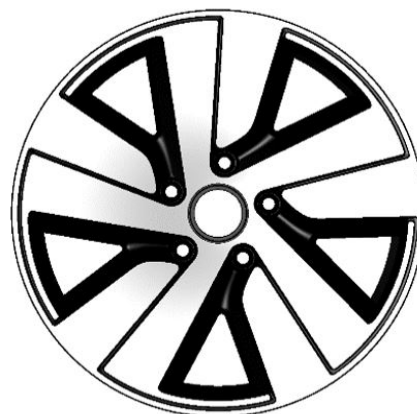
Taycan S Aero wheel, Taycan Aero wheel