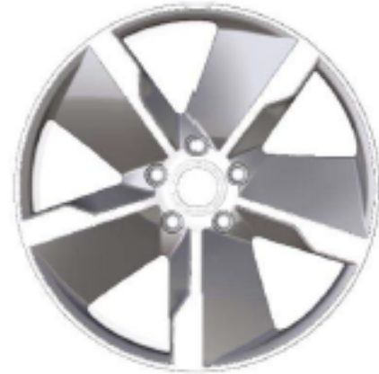
Exclusive Design wheel