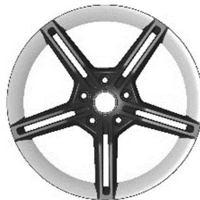
Mission E Design wheel

RA: 11.5J x 21, RO 66 Part No. 9J1.601.025.AB_FFF