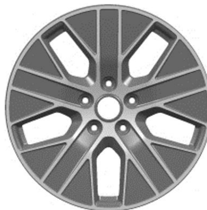
Taycan Turbo Aero wheel