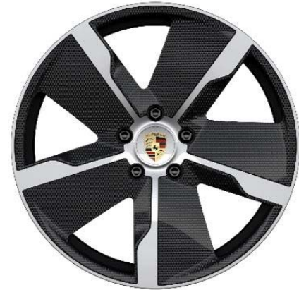
Exclusive Design wheels with carbon-fibre aeroblades