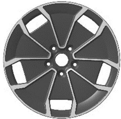
Taycan Turbo wheel