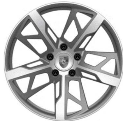
Cross Turismo Design wheel