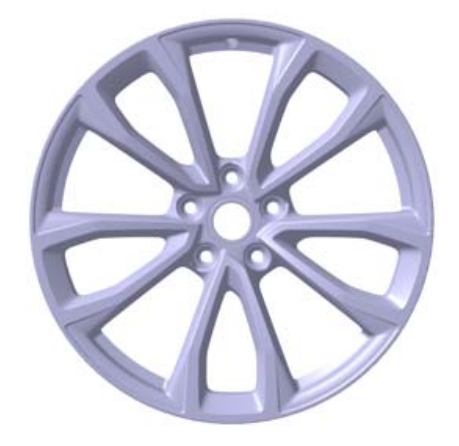
19-inch Macan Design wheel

Rear: 9 J x 19, RO 21 Part No. 95B.601.025.EH FFF