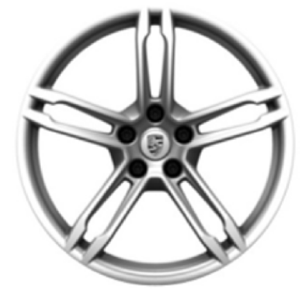
19-inch Sport wheel

Rear: 9 J x 19, RO 21 Part No. 95B.601.025.FR FFF