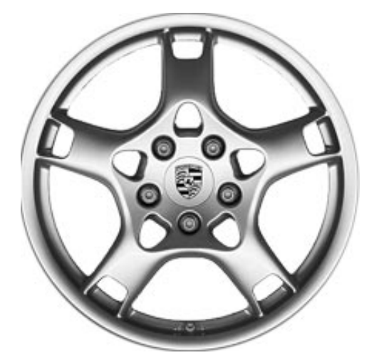
19-inch Carrera S wheel

Rear: 11 J x 19 H2, RO 51 Part No. 997.362.162.00 or 11 J x 19 H2, RO 67 Part No. 997.362.162.01