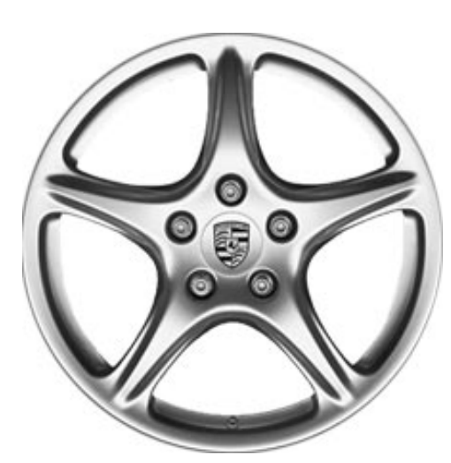
19-inch Carrera Classic wheel