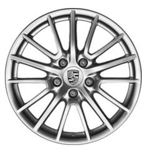
19-inch SportDesign wheel

Rear: 11 J x 19 H2, RO 51 Part No. 997.362.162.03 or 11 J x 19 H2, RO 67 Part No. 997.362.162.04