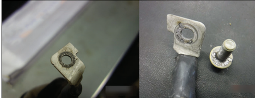
Figure 2 - Ground strap and bolt after arcing occurs. (Corrosion has increased). These parts are from a vehicle that would not start.