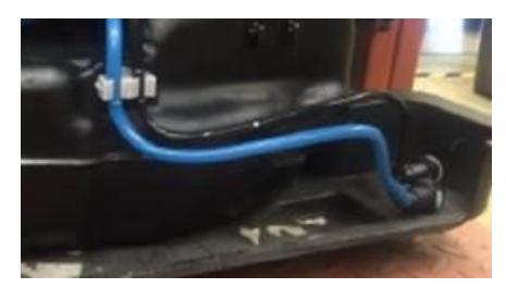
Figure 1. Lines in the tank.

Make sure there is now sufficient spacing between the fuel lines.