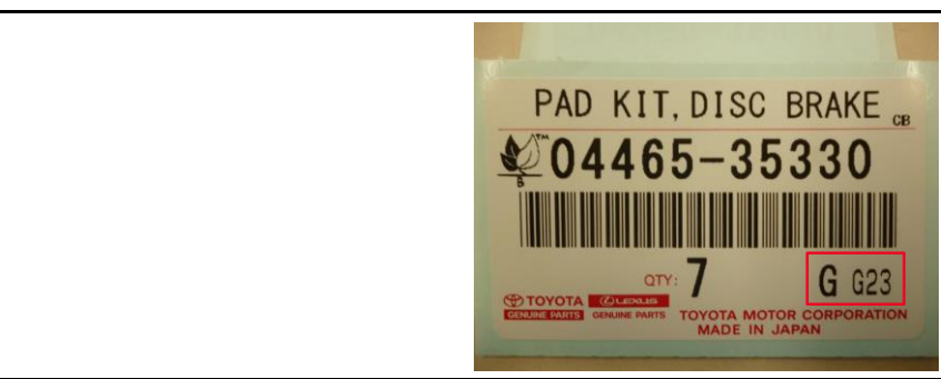
Figure 1. Pad Kit Packaging

For example: G23 – July 23<sup>rd</sup> (G = July, 23 = 23<sup>rd</sup> day of the month).