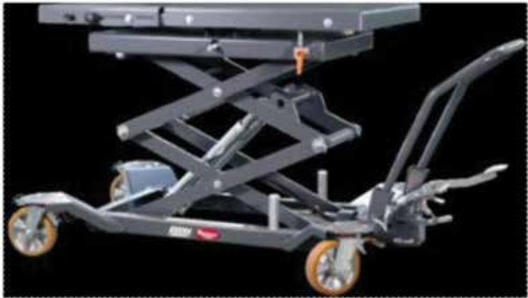
Example of Lifting Table

*** Lift table pictured above may not be an exact representation of the final version***