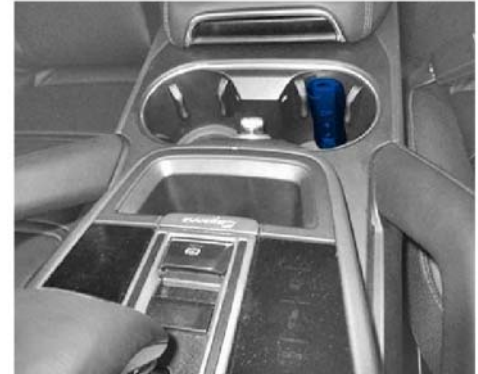
Emergency start tray

2 Position the driver's key in the rear area of the left cupholder in the center console between the holding struts (emergency start tray) in order to guarantee a permanent radio link between the vehicle and driver's key ⇒ Emergency start tray .