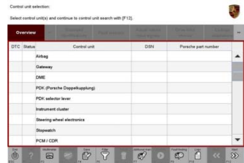
Control unit selection