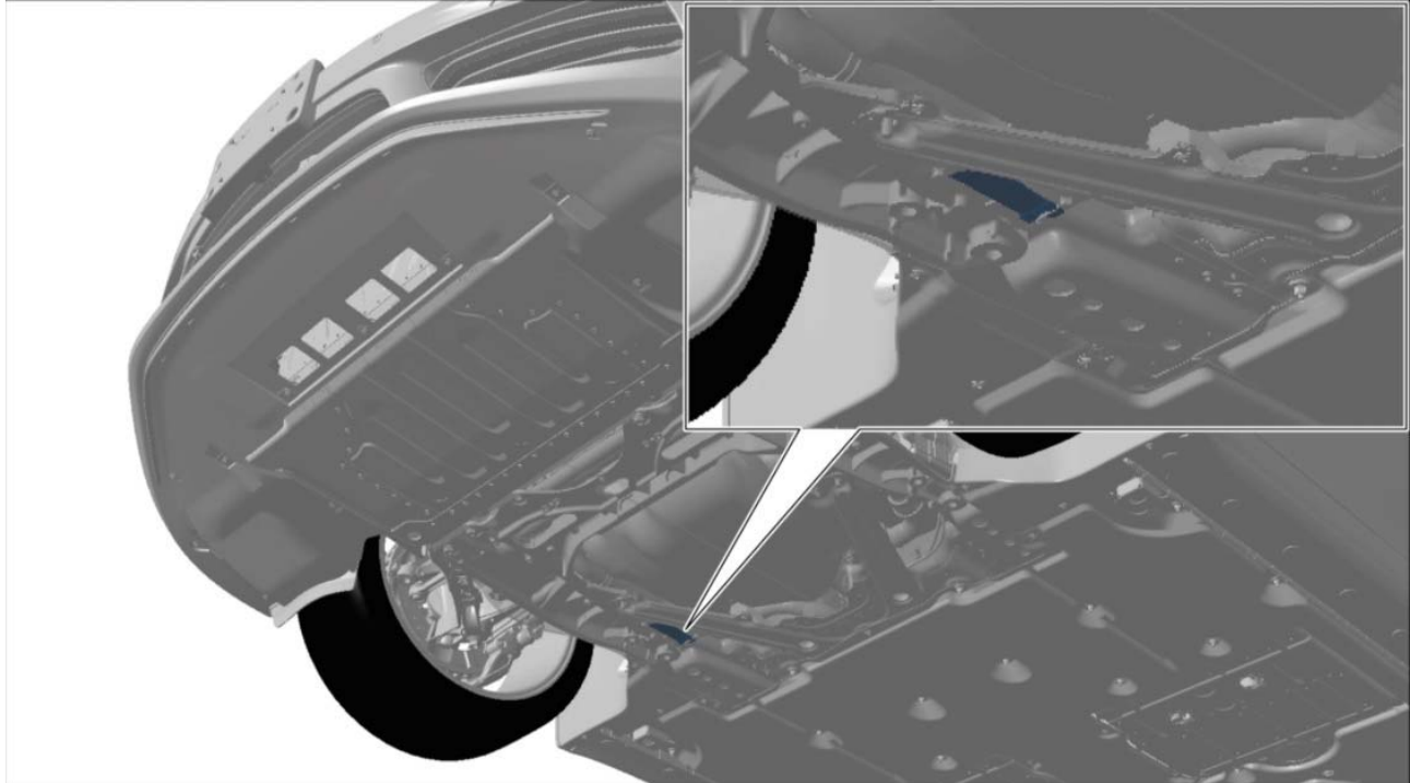
Installation position of TPM control unit

– Tire Pressure Monitoring (TPM) control unit ( retrofit )