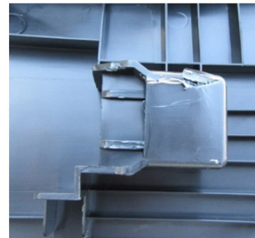
Enlarged View of Damaged Claw