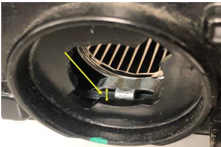
Figure 1. Tail lamp contact loose/pulled away from housing.