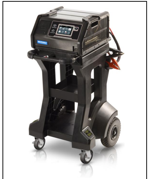
Figure 1. DCA-8000 Battery Diagnostic Tool