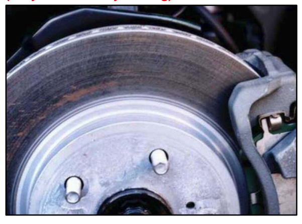
Figure 1. Slight Rust on Rotor (Easy to Remove by Braking)