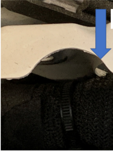
Close up of area where harness may chafe.