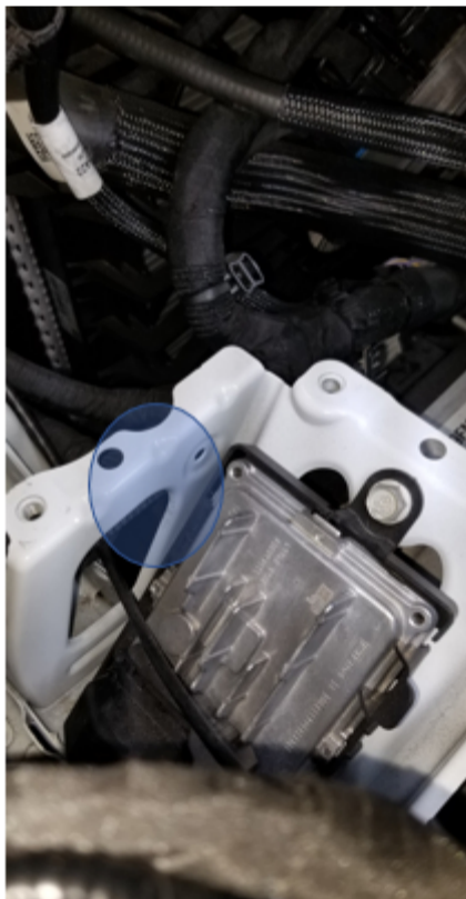
Harness may chafe in the areas shown in the photos above and below.