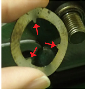
OLD Wave Washer

REMINDER: Always order the most up-to-date replacement parts based on the specific VIN being repaired.