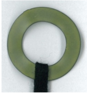
NEW Spring Wave Washer

The 3 “tang” seen on the inside of the OLD wave washer have been deleted. The new washer also has a goldish-color flurocarbon resin coating. The inside diameter of the NEW spring wave washer has been decreased and a small felt added to allow the washer to turn smoother with the buckle and have a better fit on the shoulder portion of the retaining bolt.