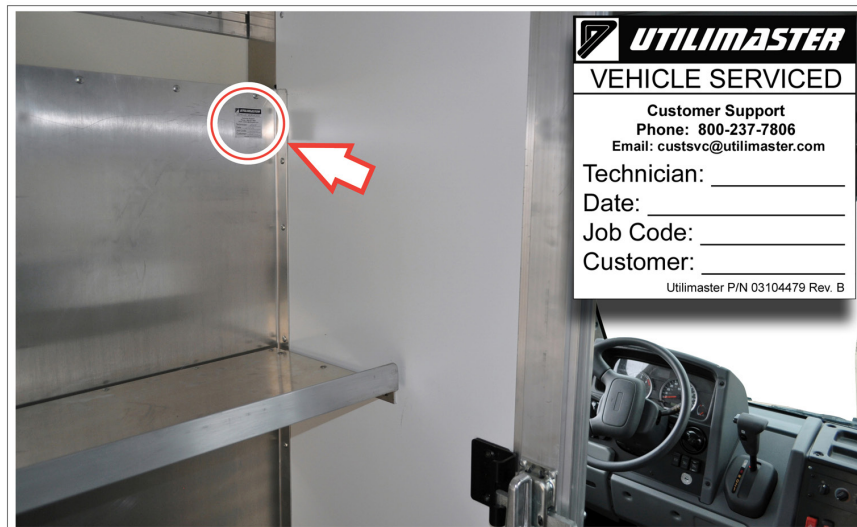
Service decal on driver's door pocket (cargo side)

NOTE: In order to be reimbursed for labor, the repair MUST be completed and warranty claim filed within one year from the initial date of this publication.