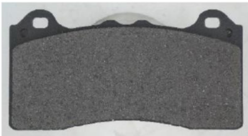
Figure 3 - Revised Brake Pad