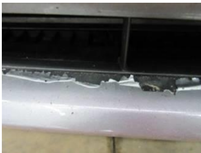
Figure 3. Moderate paint adhesion loss.

3. Figure 3 shows a close-up view of the peeling paint in this area.