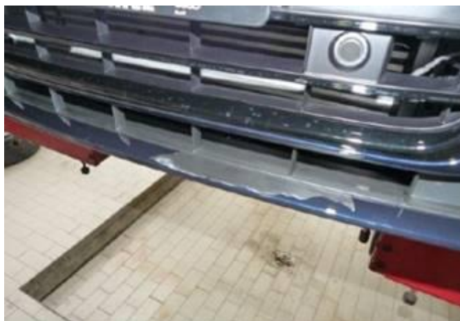
Figure 2. Loss of adhesion of the bumper paint.

2. Figure 2 shows a closer view of the peeling.