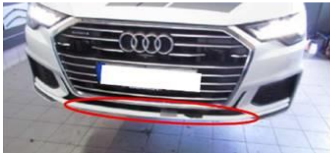
Figure 1. Lower lip section of the bumper cover.