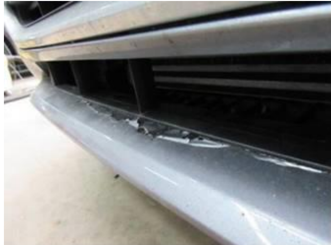
Figure 4. Side view of the bumper with the paint peeling.