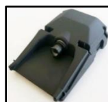
Front View Camera

Printed TSB copy is for reference only; information may be updated at any time. Always refer to KGIS for the latest information.