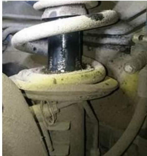
Figure 1. DRC shock absorber with clear oil loss.