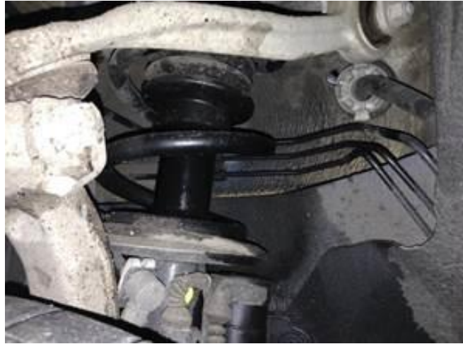
Figures 2, 3, and 4. Oil marks/residues in the wheel housing/shock absorber.