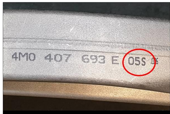
Figure 4. New guide link parts version.