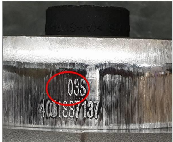
Figure 3. Hydro-bush parts number.