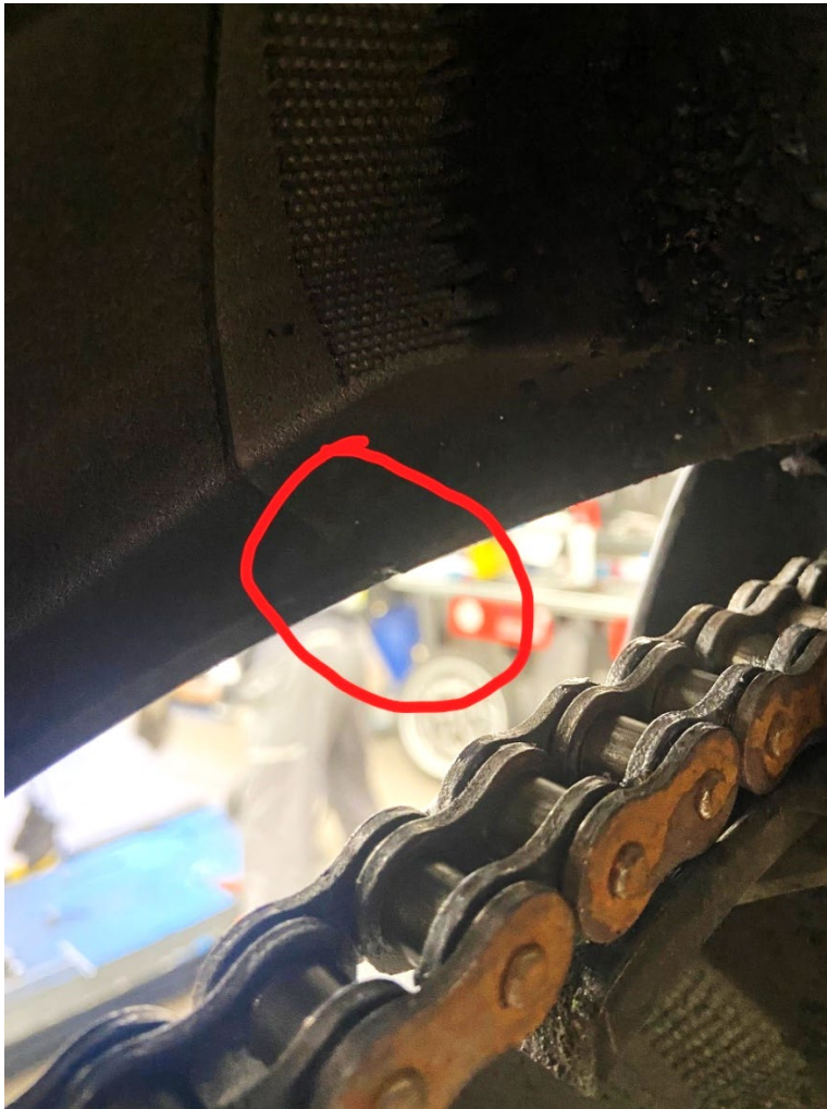
Figure 1: Location of damage on swing arm

Depending on the chassis and suspension adjustment, as well as vehicle load, the drive chain may make contact with the swing arm under certain conditions.