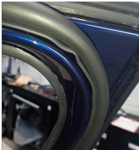
Figure 1. Outer door seal detached from the door.

The adhesive bond for the outer door seal can come loose in the entire area where the outer door seal makes contact with the door (Figures 1 - 4).