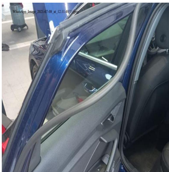
Figure 3. Outer door seal detached from the door.