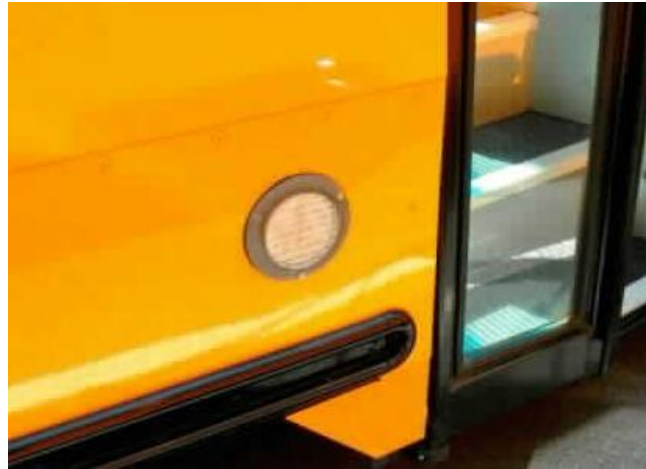
SKIRT MOUNTED LED LIGHT vs. INCANDSCENT LIGHT

Effective 5/7/21, we will no longer offer incandescent skirt-mounted light options on new orders for our Saf-T-Liner C2 and Saf-T-Liner HDX and EFX products. Improved quality of the LED light compared to the incandescent light along with the growing market trend towards LED are the key drivers for this decision. This move also reduces product complexity and increases expected LED volumes which support our product cost position and allows for list price reductions of the skirt mounted LED light options.