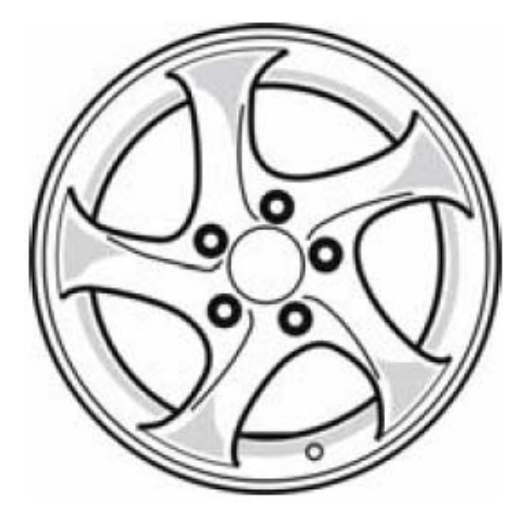
18-inch Turbo Look II Rad