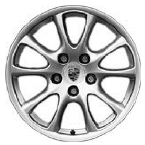
18" GT3 wheel

front 8 J x 18 H2, RO 50 rear 10 J x 18 H2, RO 65