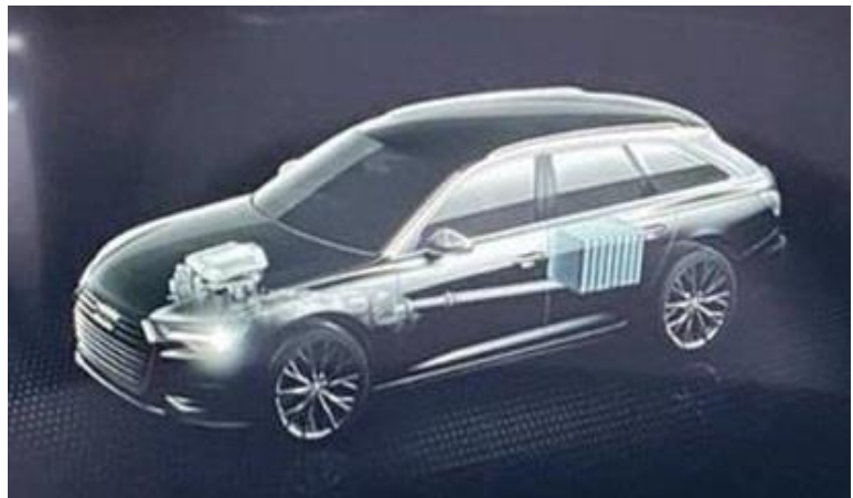
Figure 1. Hybrid vehicle is incorrectly displayed in the instrument cluster.