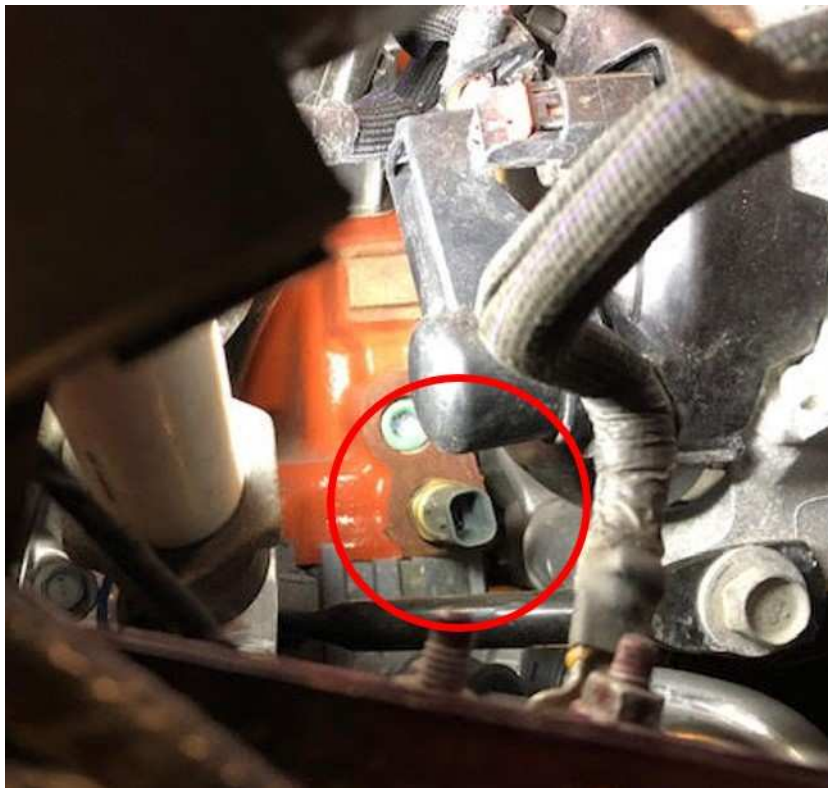
Fig. 2 Oil Temp Sensor