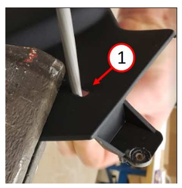
Fig. 1 Back Side Shield Hole Being Elongated