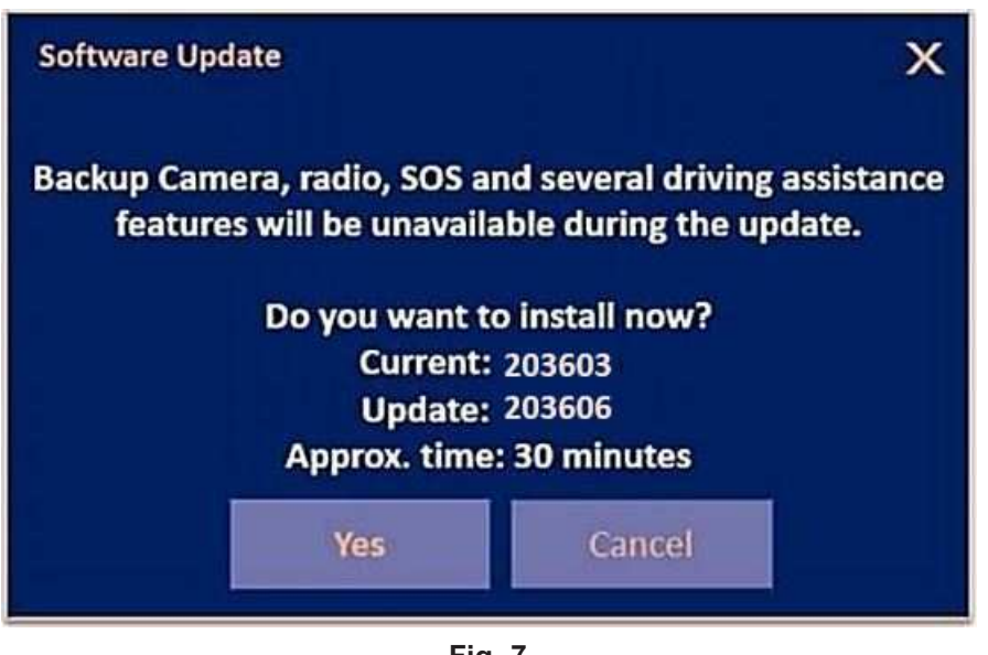
Fig. 7 Update Ready to Install