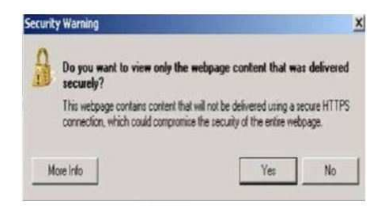
Fig. 2 Pop-Up Security Message

NOTE: If the software cannot be downloaded, make sure you have proper security access. If not, have the Service Manager or Shop Foreman download the software update.