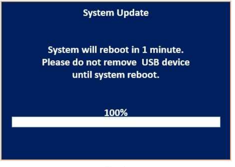
Fig. 8 Do Not Remove USB Flash Drive

19. Wait for the "Radio was successfully updated" screen (Fig. 9).