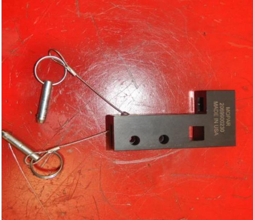
Mopar special tool 2069900230

Tool 2069900230 has multiple ½” drive squares to allow different pry locations to aid in adjusting striker loop using different length ½” drive socket extensions. The pins lock the tool to the striker. Service information is in process of being updated and Mastertech will be discussing this tool’s usage.