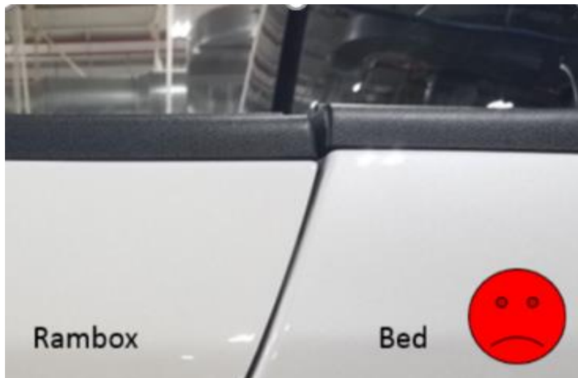
Under flush condition

After adjusting the lid parallel in step 1, if the lid is under flush to the bed trim and/or closing effort is high, open the lid and use pry tool to bend the striker UPWARDS to raise the lid. Over flush requires a striker move DOWNWARDS to lower the lid.