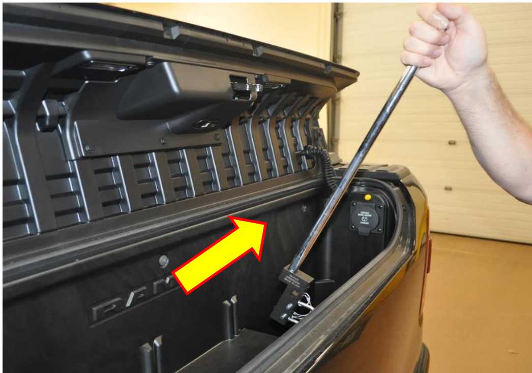
Bending the striker upwards to raise lid.

This document does not authorize warranty repairs. This communication documents a record of past experiences. STAR Online does not provide any conclusions about what is wrong with the vehicle. Rather, it captures all previous cases known that appear to be similar or related to the vehicle symptom / condition. You are the expert, and you are responsible for deciding on the appropriate course of action.